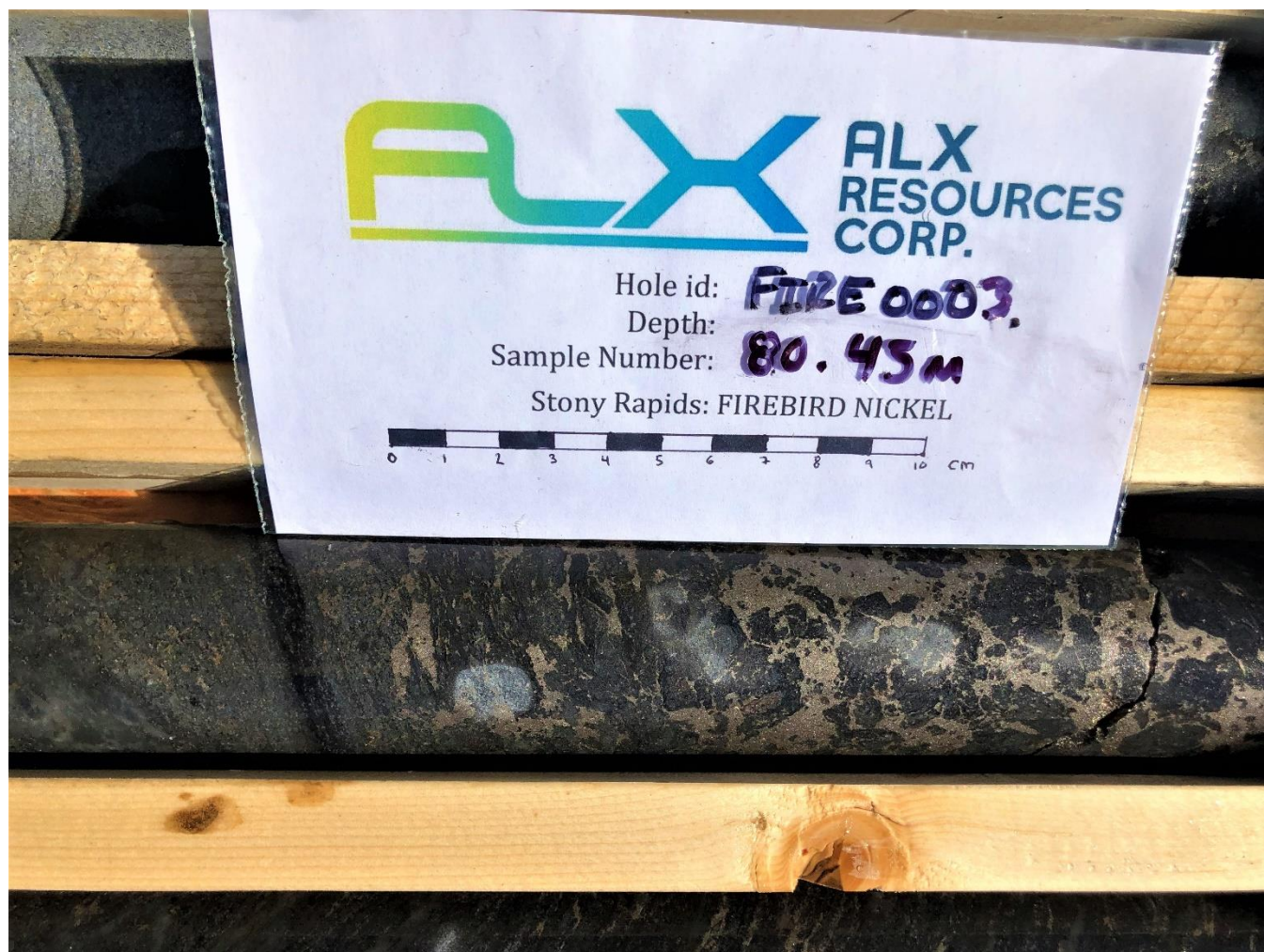
Example of sulphides at 80.45 metres intersected in hole FIRE-003

The 2021 Firebird drilling program faced a number of challenges, including mechanical difficulties and extreme heat that impacted drilling efficiency. All drill holes received downhole electromagnetic surveys after their completion to better define the targeted geophysical anomalies, which resulted in a reset of hole FIRE-002, having undercut the targeted conductor. The fourth target area, Currie Lake West, was not tested in this summer 2021 program due to the pending unavailability of the helicopter and drill.